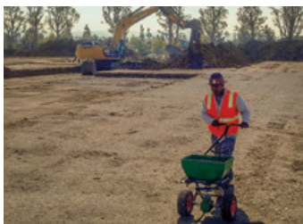
Can be mechanically or manually applied, no water needed.

Make your budget go at least 5x further. Contact us to find out how.